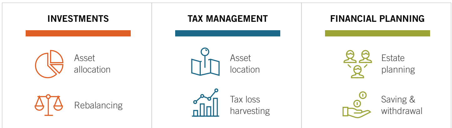
Exhibit 1 Where a financial advisor can add value

The nightly news will always include a mention of what the S&P/TSX or Dow Jones indexes did. While these broad benchmarks have a role to play in evaluating investment returns, the truth is that most investors fall far short of “market” performance. Independent research firm DALBAR estimates that the average stock investor in the U.S. trails the stock market by nearly four percentage points annually, while Morningstar has estimated that mutual fund investors